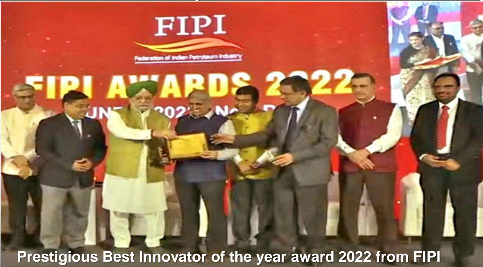
Prestigious Best Innovator of the year award 2022 from FIPI

HP DWA: Novel dewaxing aid additives for enhanced lube oil quality and efficiency