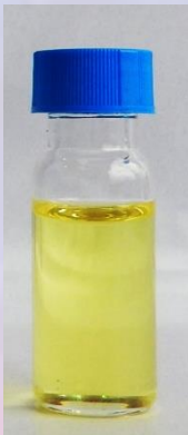
HP Shine Pro