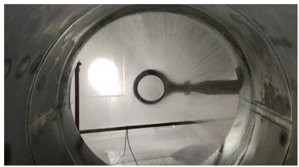
Spray Pattern of R&D supplied Scrubber Nozzle at MR

HPCL designed scrubber nozzles commissioned at Mumbai Refinery FCCU's